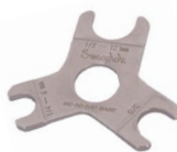
Gap Inspection Gauge