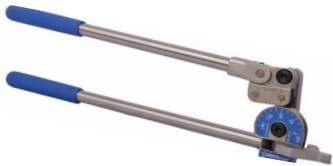
Hand Tube Bender