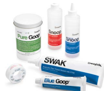
Leak Detectors Sealants