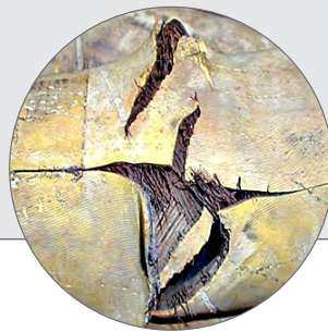
Excessive Cover Damage