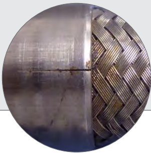
End Connection Damage

Keep your plant and processes safe, predictable and dependable with leak-tight products and best practices to reduce the risk of injuries and environmental damage.