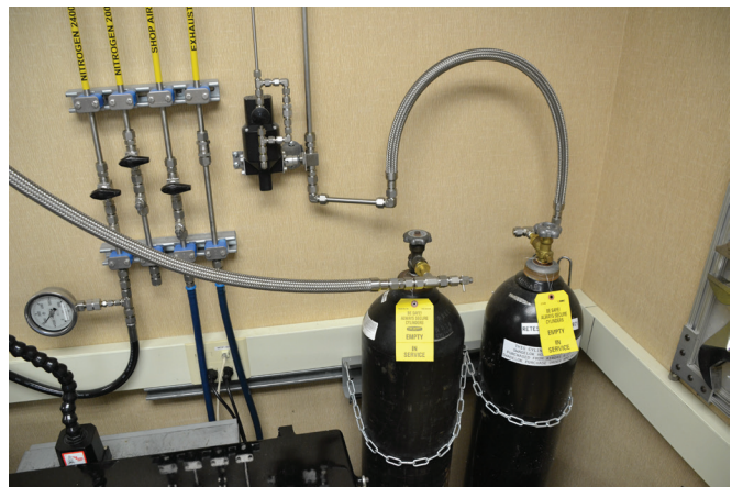
High-pressure gas distribution